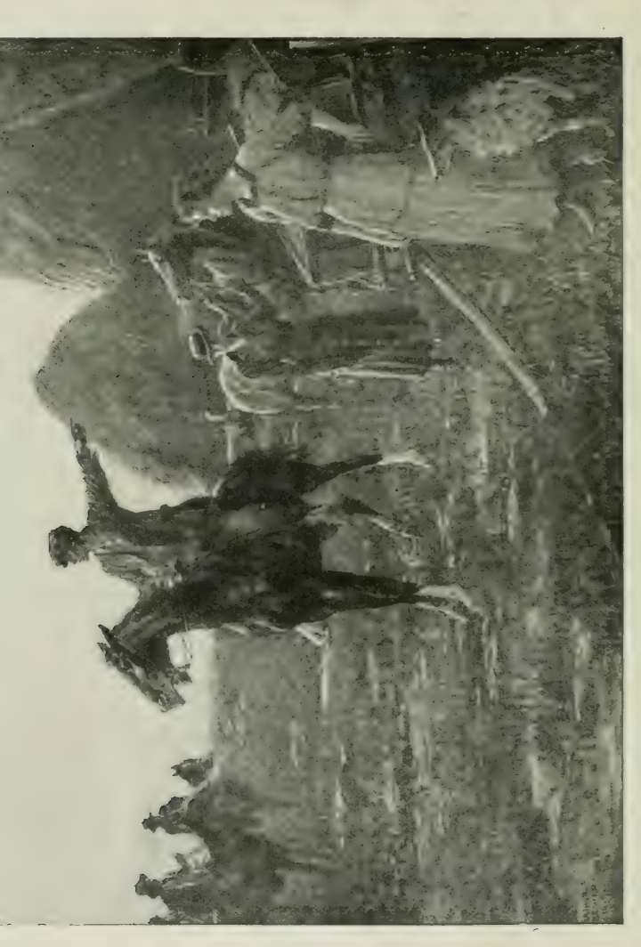
"Swing twenty paces out from one another and circle this shack!"